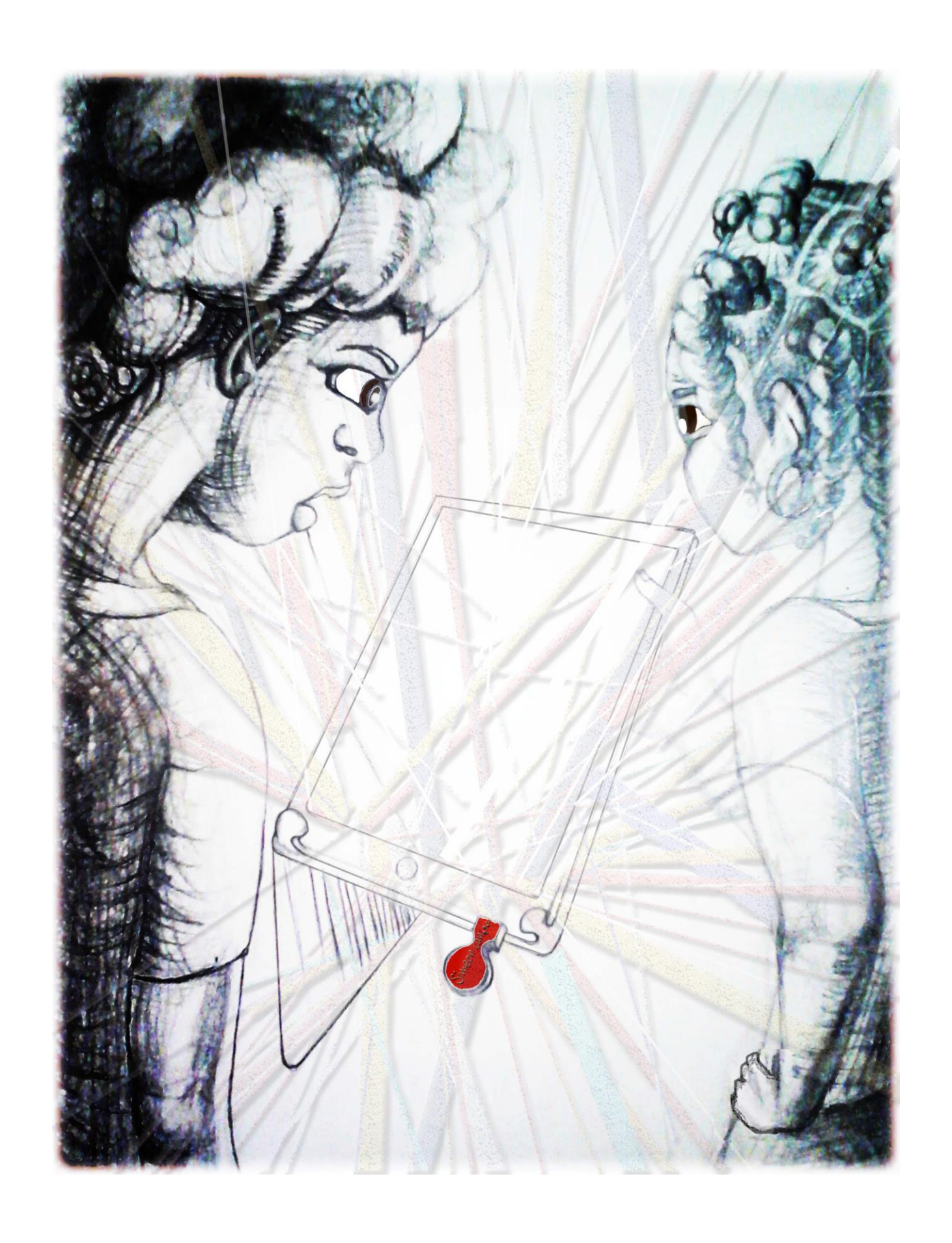
To be continued online...